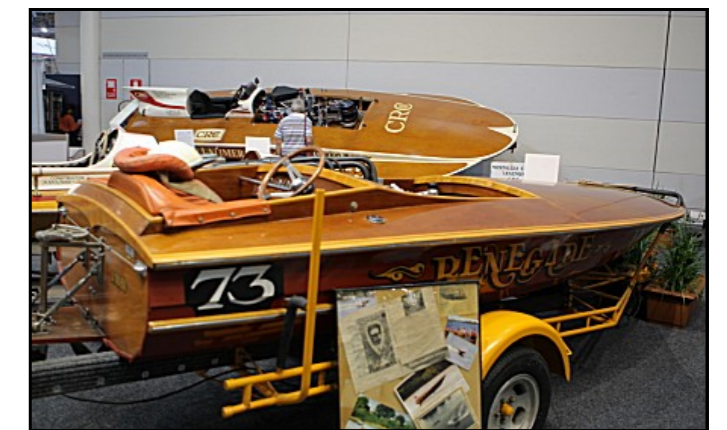
It really was a great display with nothing but favourable feedback.