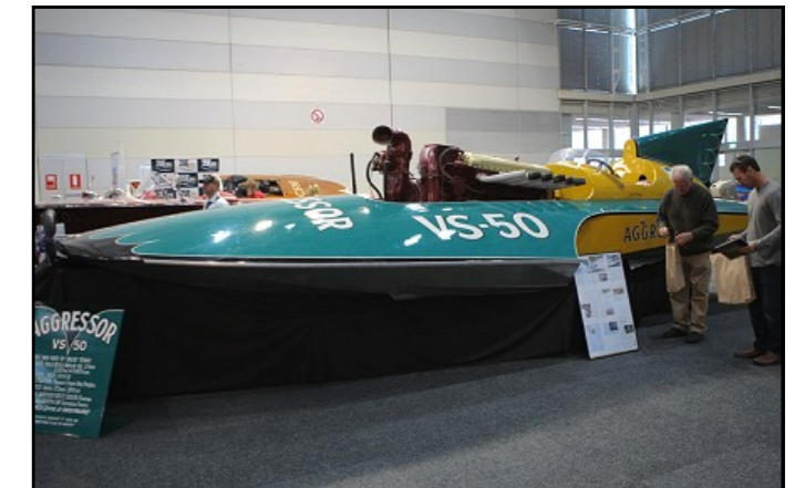
Boats on show were: Hydros - Aggressor , Atomic , JMH , Latimer Lodge and a Molinari , runabouts were Cassatta (Abbatte), Cesilde

Indianapolis race car. The owner did an incredible job of maintaining the boat's patina. Its hard to tell the current configuration was recently created. An equally unrestored T Ford Coupe was displayed towing the boat.