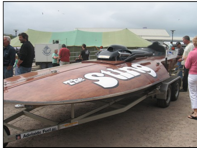
At the 2007 Goolwa Wooden Boat Festival

I built a fairly lumpy 454 Chev that shows 570 hp on the dyno. The boat has 55% step up through the gearbox. We checked fuel consumption - 343 metres per litre on Avgas!