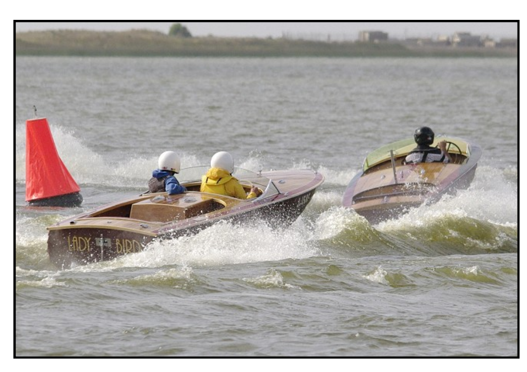
Close "spirited demonstration" at the 2014 Goolwa Aquafest