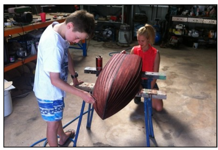
Construction detail is quite fine and accurate to the real boat, as can be seen by the deck frames, details that will be covered later by the deck.