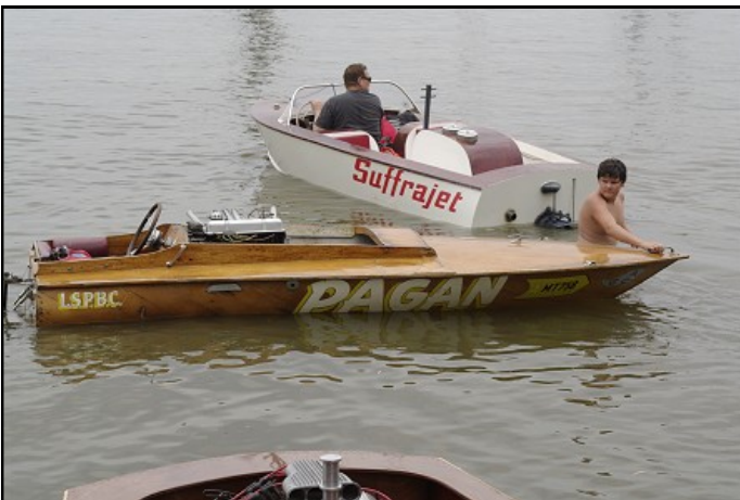
Pagan being assisted back to the ramp