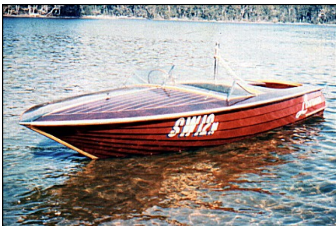
"Lowanna" in earlier days

The hull is in excellent condition, meaning it shouldn't be too long before we see this beauty back on the water. I'm tipping (hoping) Narrandera.