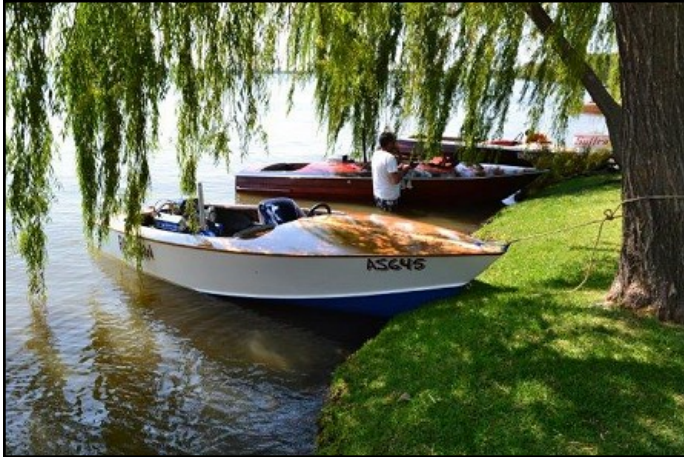
A few of the boats lined up