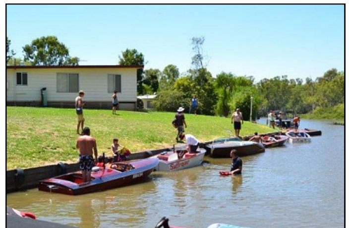
Arrival at Bundalong

This weekend is definitely cementing itself on the Victorian Chapter's event calendar.