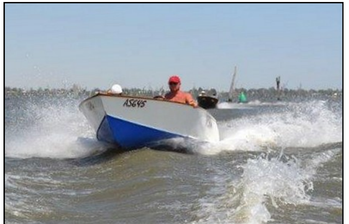
RicShaw making its way to Bundy

things have been pretty quiet about it. Not even any embarrassing photos placed in the member's area on the Bulletin Board. Very disappointing folks!