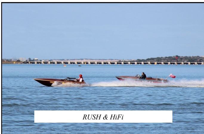
RUSH & HiFi

With the particularly cold Winter we've seemed to have this year in the South, picking a good day can be difficult. This was the case in July with the first proposed Saturday being postponed a week due to the forecast of thunderstorms and hail. The weather on the following Saturday however was completely the opposite, beautiful blue sky, hardly any breeze, meaning pretty flat water. Nevertheless, the air and water were still very, very chilly. More than one person donned a Beanie whilst they raced across the water, launching and retrieving was done with more attention than usual taken of the height of the water up one's legs.