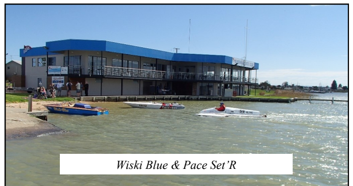
Wiski Blue & Pace Set'R