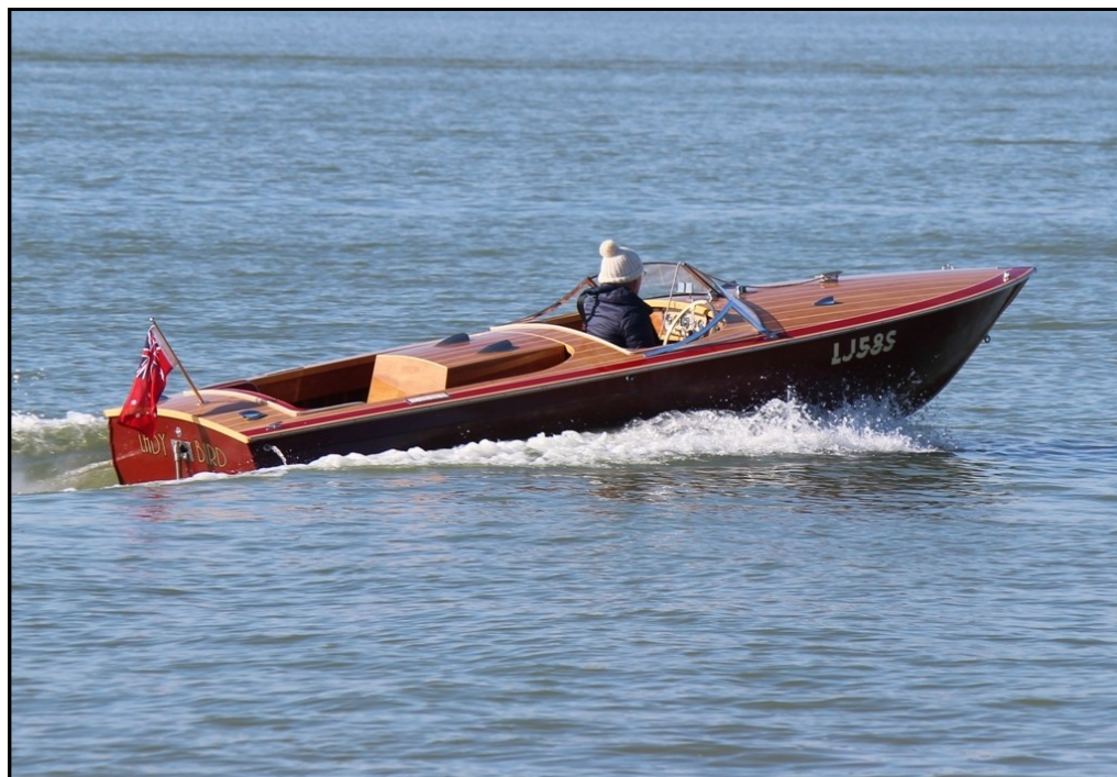
Winter boating — Sun out, flat water but very chilly!