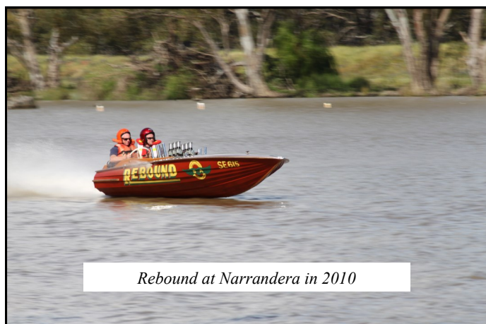
Rebound at Narrandera in 2010

We look forward to seeing Rebound tearing around Lake Talbot once again.